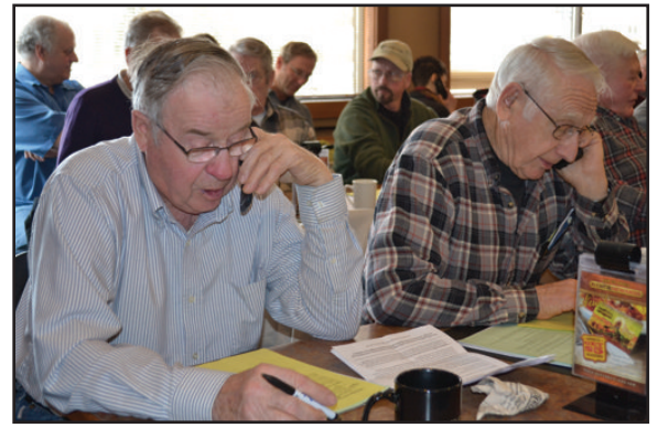
At the organizing meeting in New Ulm, LSP members called Minnesota lawmakers and told them to keep the MPCA’s Citizens’ Board strong.