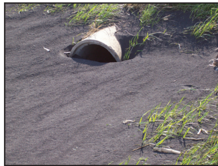
Intense tillage and unprotected winter soil makes for year-round erosion. This photo was taken in May along a road between Marshall and Montevideo.