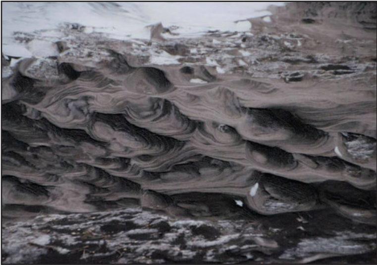
The dark color of this eroded soil in Big Stone County provides a clue as to the richness of the resource being lost.

Perhaps the most troubling photo is the bottom one on the right. It was taken on a day in May, after the winter snows had melted. That soil, which is supposed to be in an adjacent field, is instead clogging a road culvert. At a time of year when our black gold is supposed to be beginning its job of producing food, it’s instead occupying the role of messy nuisance. It’s at this point that live soil becomes dead dirt. □