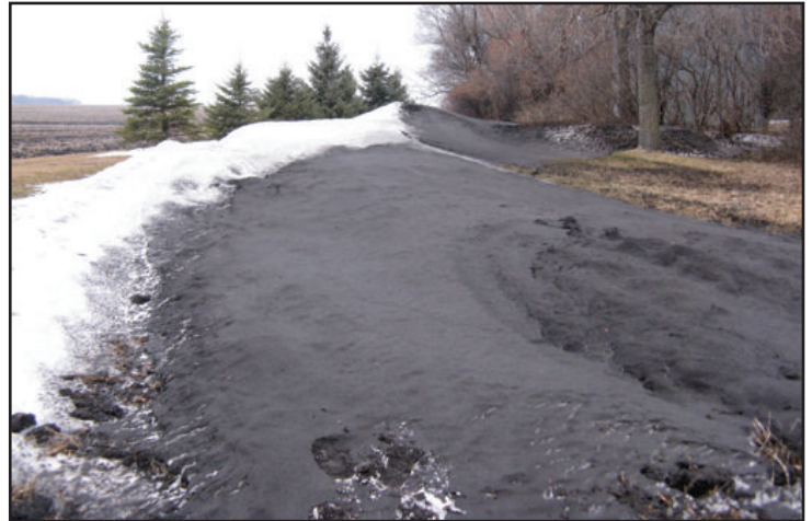
Soil deposited on a snowbank at a farmstead in Yellow Medicine County. The soybean field to the left of the trees was tilled with a disc last fall.