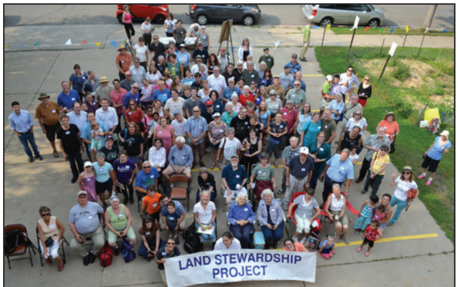
LSP sees member-to-member membership drives as key ways to grow the power needed to make the change we seek.