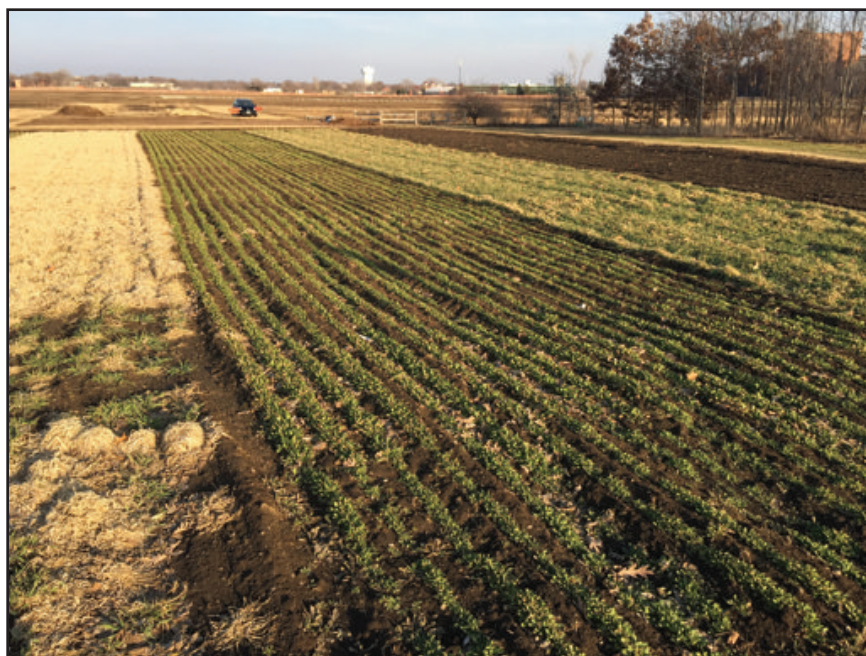
Green pennycress covers the soil in a U of M test plot soon after snowmelt on March 13 of this year.

• • • “Farmers are increasingly demanding risk management and resiliency from their fields.” • • •