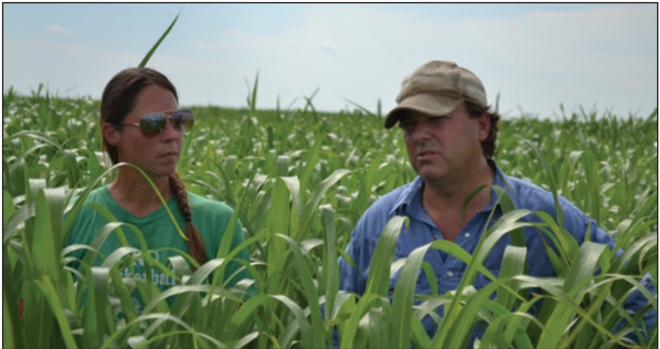
Neck deep in cropping systems that make the land more resilient (pages 14-20).