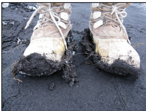
Snow boots become mud boots in a Yellow Medicine County farm yard downwind from a tilled field.