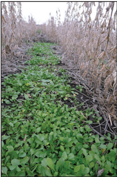
Pennycress covering the soil between soybean rows. Estimates are that growing pennycress and soybeans together can increase per-acre production of oilseeds by 40 percent.

much synthetic nitrogen, as well as reduce a lot of the leaching that we're seeing in the landscape. Hairy vetch flowers are also beautiful, and provide resources for pollinators and beneficial insect predators. So, how do you convince the public? I think people are starting to recognize that these environmental services really do have value, and who wouldn't like to see a little more green on the landscape?"