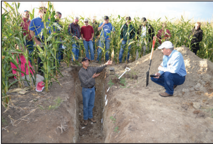
A new LSP on-farm research initiative will examine how to integrate soil-friendly practices into a corn production system.

Seed selection, seeding rates, planting times, equipment needs, enterprise analysis, yields, impact on livestock gain or the volume of milk in the tank, and what happens to the health of the soil will be scientifically measured, observed, photographed and recorded for two years on Minnesota and Iowa crop farms. Comparable data from neighboring conventionally managed corn fields will