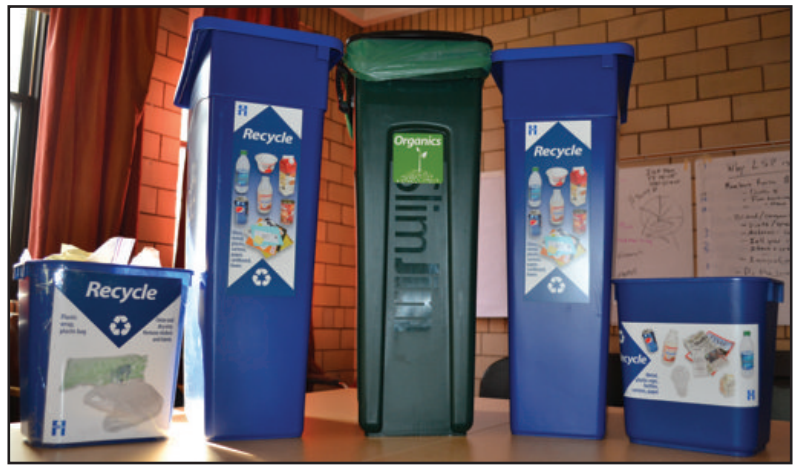
In our Twin Cities office, LSP has clearly labeled desk-side recycling bins, and has replaced individual desk trash cans with larger trash, compost, and recycling bins in the main areas.

This is meant to encourage recycling by making it easy. This system will also increase awareness of how much and what is being thrown away by requiring employees to seek out a main trash can. This has been a joint effort by myself and Megan Smith from LSP's Individual Giving Program. This project also includes the other tenants in LSP's building: Powderhorn Park Neighborhood Association and Full Cycle.