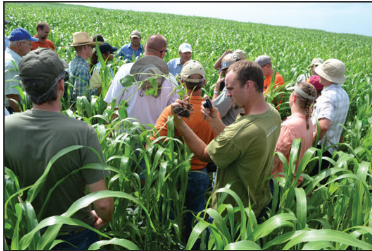
Farmers in Burleigh County, N. Dak., utilize cover crops to build the kind of soil that can preserve as much moisture as possible—an important resource in an area that receives roughly 16 inches of precipitation annually.

This has produced some decidedly negative results for the public at large when it comes to economic viability of rural com-