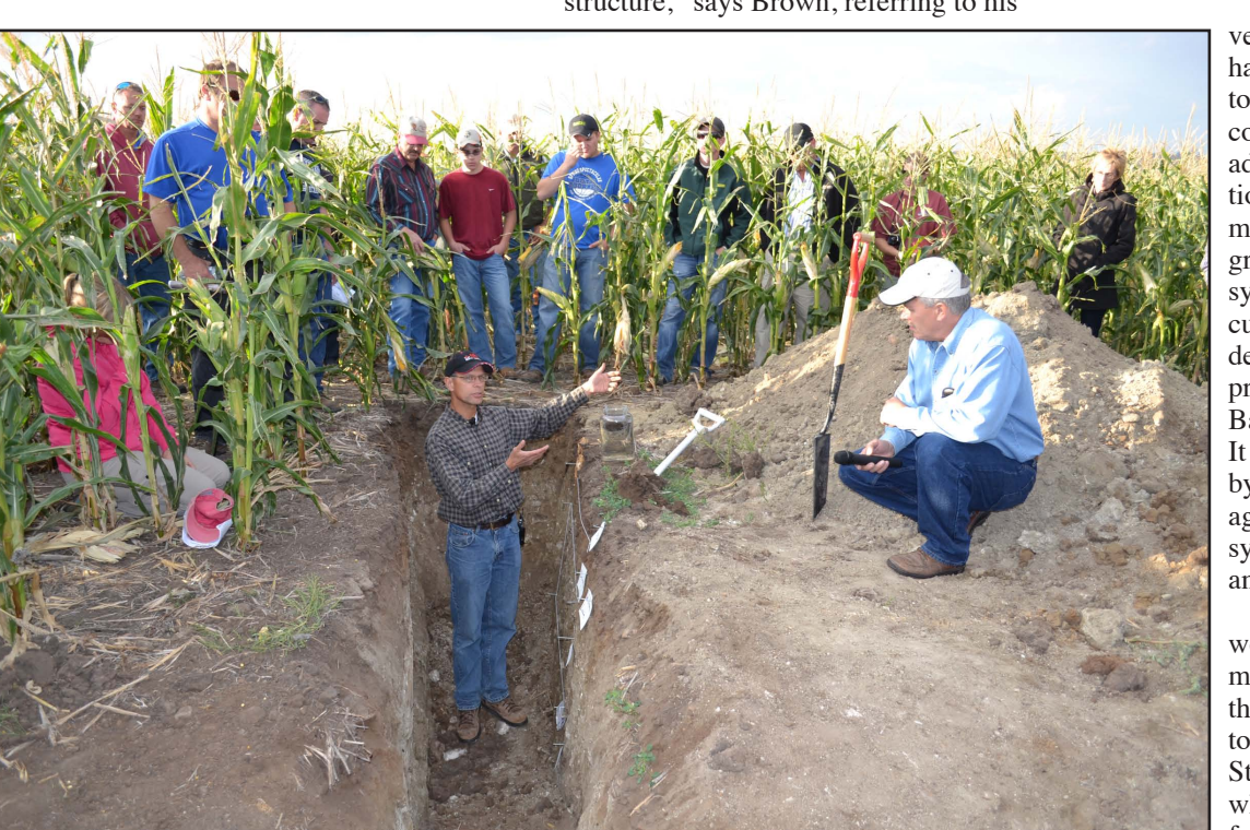
Farmers in Burleigh County studied the soil profile in a corn field during a recent field tour. Farmers, conservationists and scientists working in that region believe soil's potential to develop its own fertility has yet to be fully tapped.