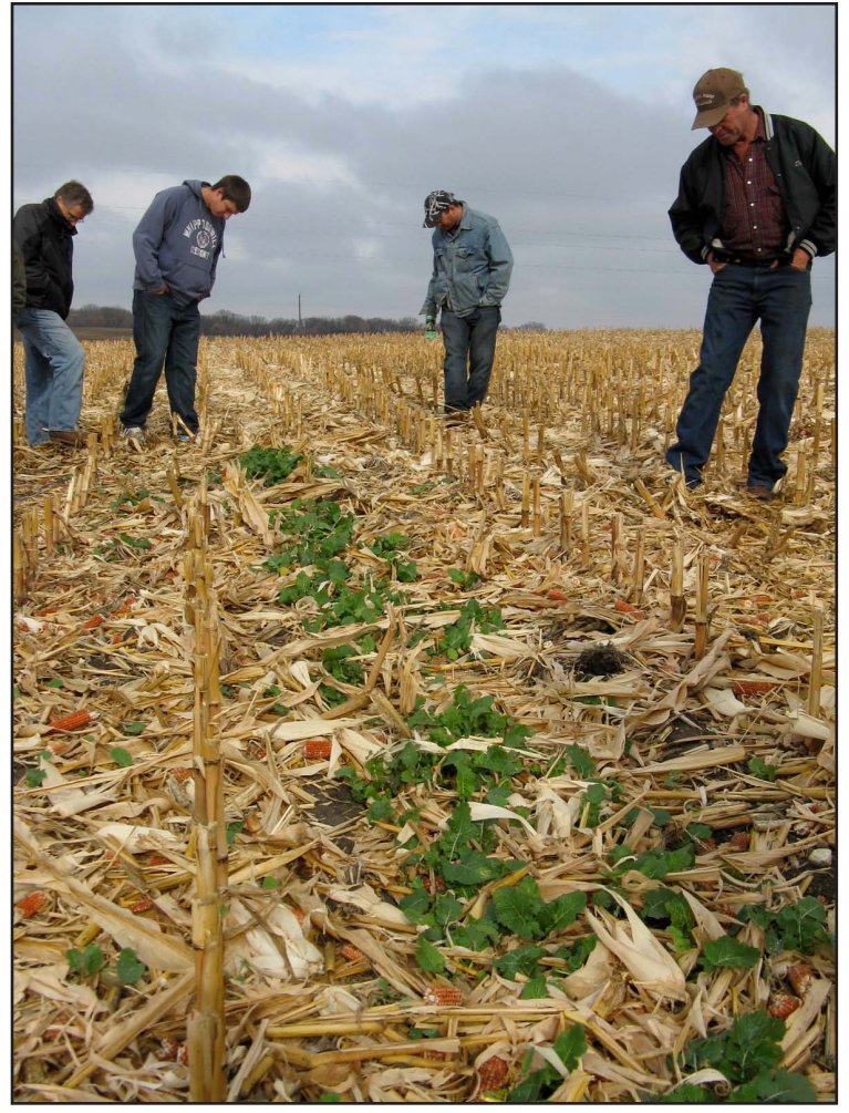
Dan Jenniges ( right ) helps attendees of a cover crop field day at his farm hunt for green growing plants in the corn residue. Jenniges seeded turnip and rape in the standing corn in late June.

with low-cost, quality animal feed, cover crops fit with the overall goals of the Chippewa 10% Project. Our belief is that there are economically viable ways for farmers and landowners to get diversity and more living cover on acres in the watershed. That diversity is what will make our soils more resilient and our water cleaner while putting