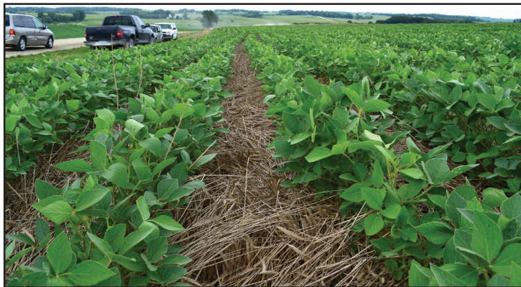
Cover crops such as cereal rye that are planted in the fall and terminated in the spring build soil health, reduce erosion, and disrupt weed cycles. They also help keep nitrates out of water.

“We’re allowing this to happen, but what can we do to prevent this in the first place?” Caitlin Meyer, the water resources coordinator for the Olmsted SWCD says, describing