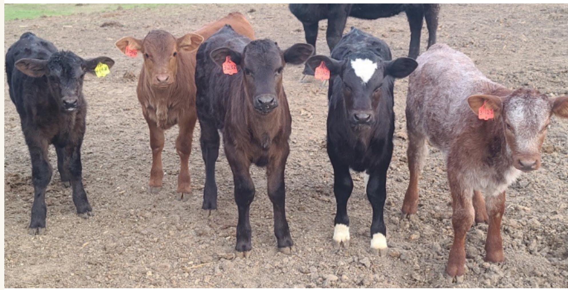
One of every flavor in this group of calves on Al Jostock's farm outside of Hammond, Minn.

The weather is warming up, the birds are singing again, and the green blades of grass are starting to pop up in the pastures. Spring is here!