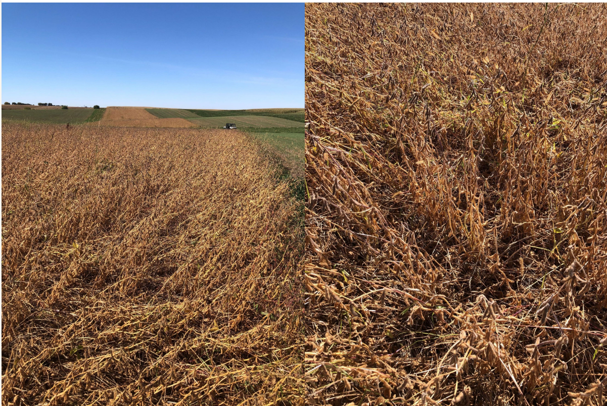
Roller-crimped soybeans near Plainview, Minn. Photo taken Oct. 4th